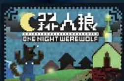
Need only few ppl, 10min, But it's Werewolf GAME!

The original Japanese version of One Night Werewolf was released in January 2013, and sold 10,000 copies in six months, becoming an unprecedented hit in Japan. By being playable with 3-7 players, taking only ten minutes with no downtime, it overcame some of the issues with certain Werewolf games that need a large amount of players and take a long time to play. It became the basis for One Night Ultimate Werewolf which expanded on the basic concept, with One Night Werewolf being the lighter, compact version and One Night Ultimate Werewolf the deluxe version.